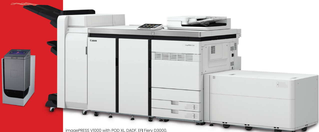
imagePRESS V1000 with POD XL, DADF, EFI Fiery D3000, Booklet Finisher-AF Series & LS Catch Tray

Quality. Versatility. Productivity. The imagePRESS V1000 digital press gives you the tools you need to compete and thrive in the demanding print world.