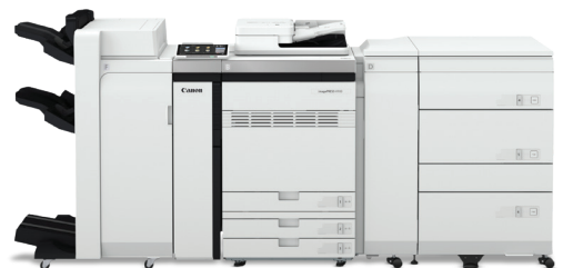
imagePRESS V900/V800/V700 with MultiDrawer, DADF & Booklet Finisher-AG Series