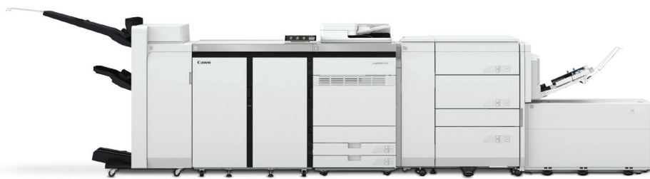
imagePRESS V1000 with MultiDrawer, POD XL, Bypass, Long Sheet Tray, DADF, Booklet Finisher-AF Series & LS Catch Tray