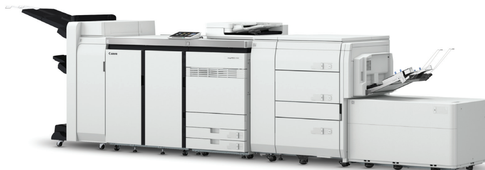
imagePRESS V1000 with MultiDrawer, POD XL, Bypass, Long Sheet Tray, DADF, Booklet Finisher-AF Series & LS Catch Tray

*Optional Accessory & Capacity based on 80g/m 2 (gsm)